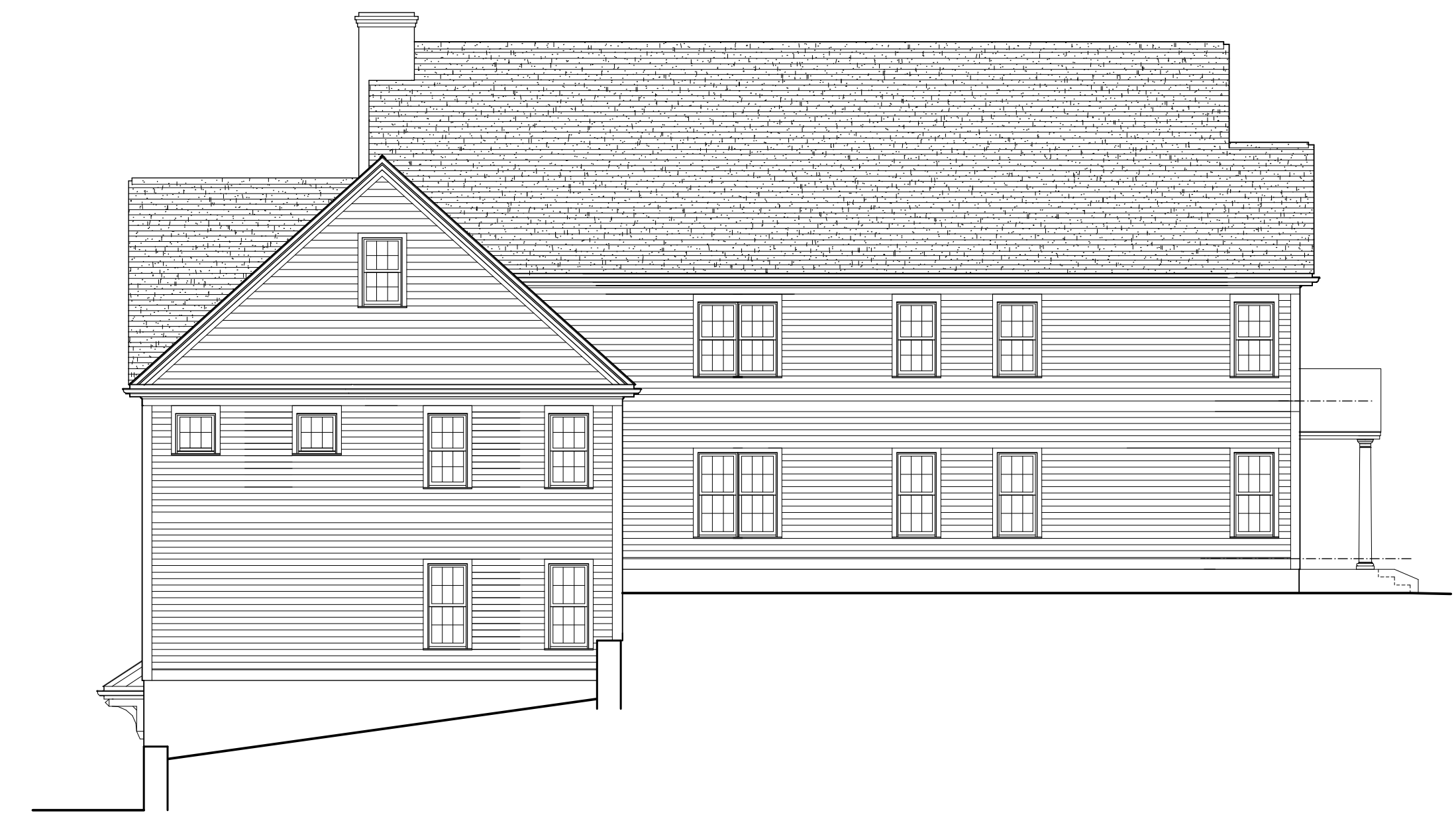
4 UNITS #1 & #2 WEST ELEVATION SCALE: 1/8" = 1'-0"