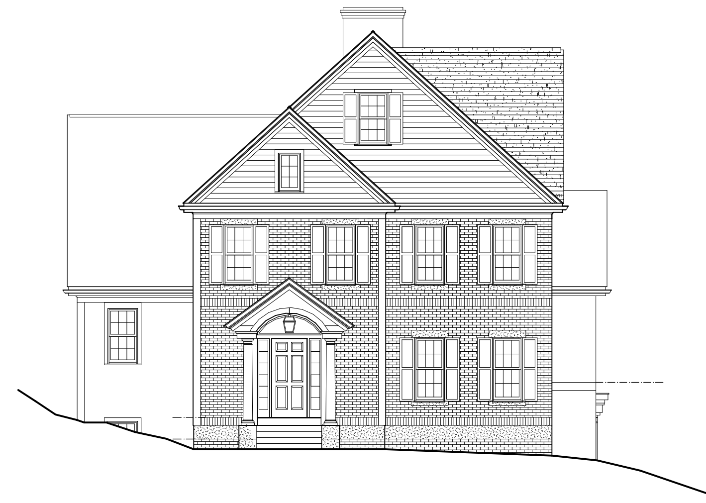
1 UNIT #1 SOUTH ELEVATION SCALE: 1/8" = 1'-0"