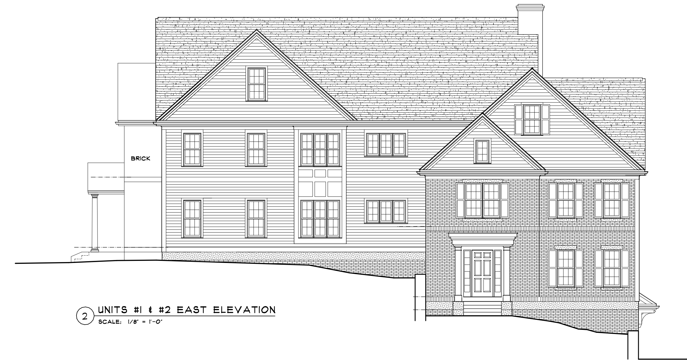
2 UNITS #1 & #2 EAST ELEVATION SCALE: 1/8" = 1'-0"