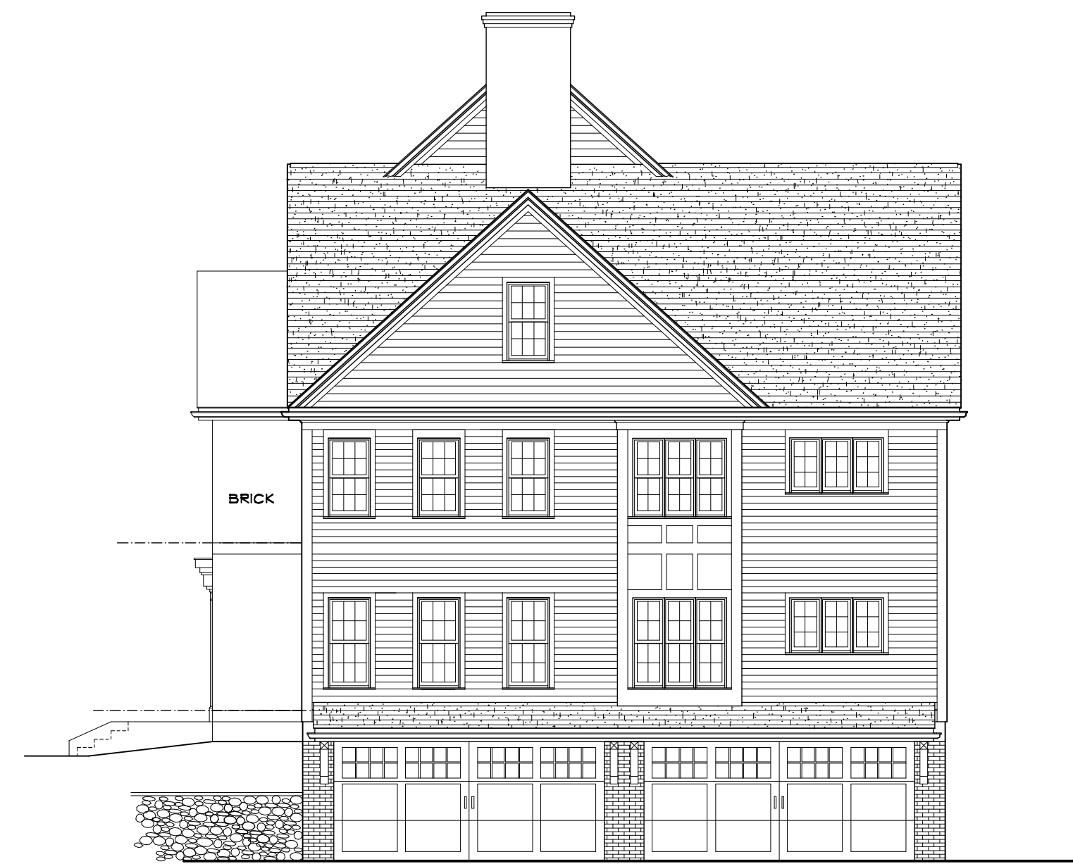
3 UNIT #2 NORTH ELEVATION SCALE: 1/8" = 1'-0"