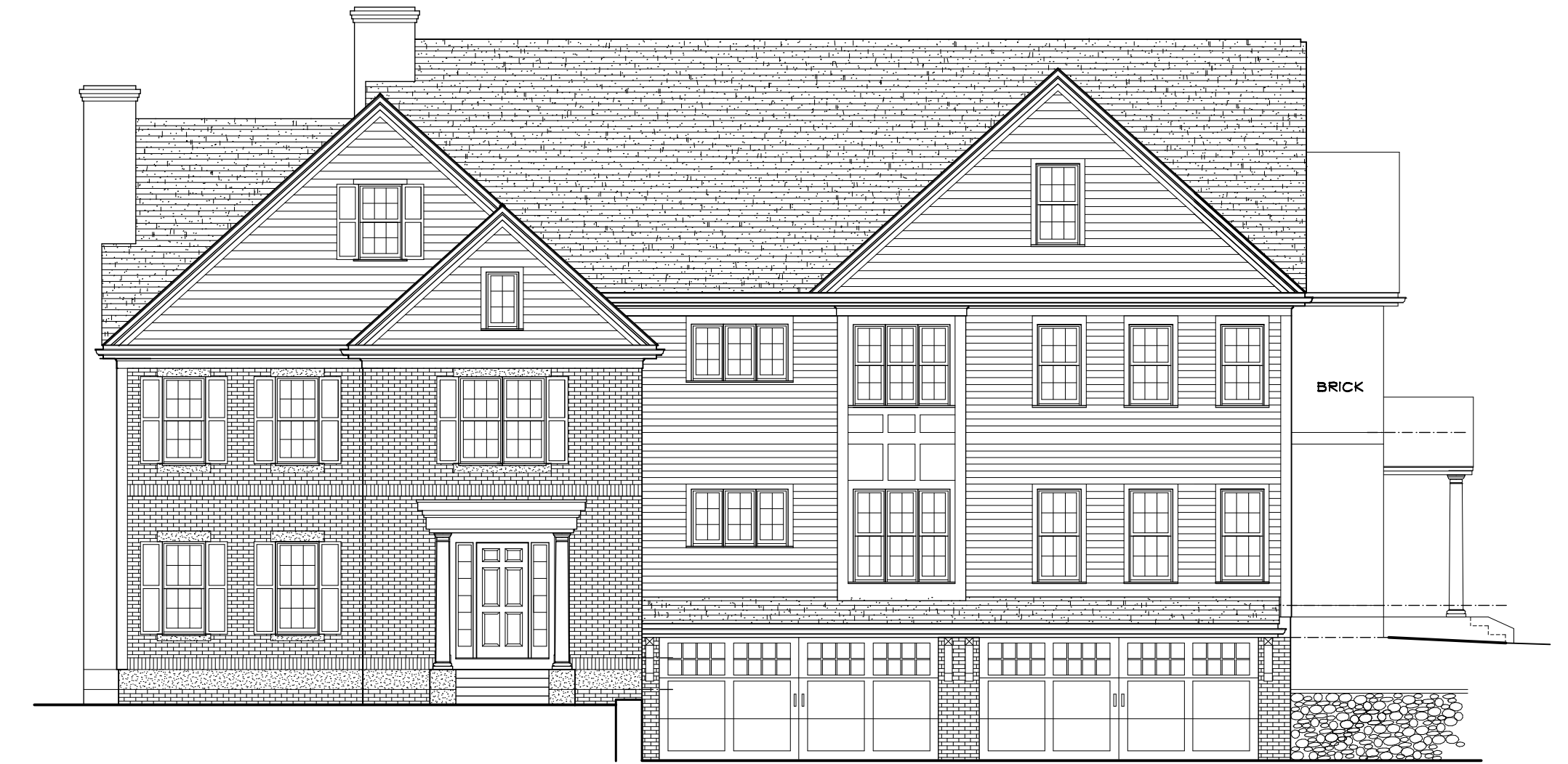
6 UNITS #3 & #4 SOUTH ELEVATION SCALE: 1/8" = 1'-0"