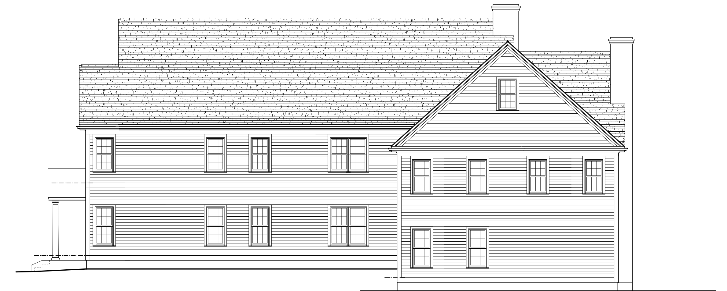
8 UNITS #3 & #4 NORTH ELEVATION SCALE: 1/8" = 1'-0"