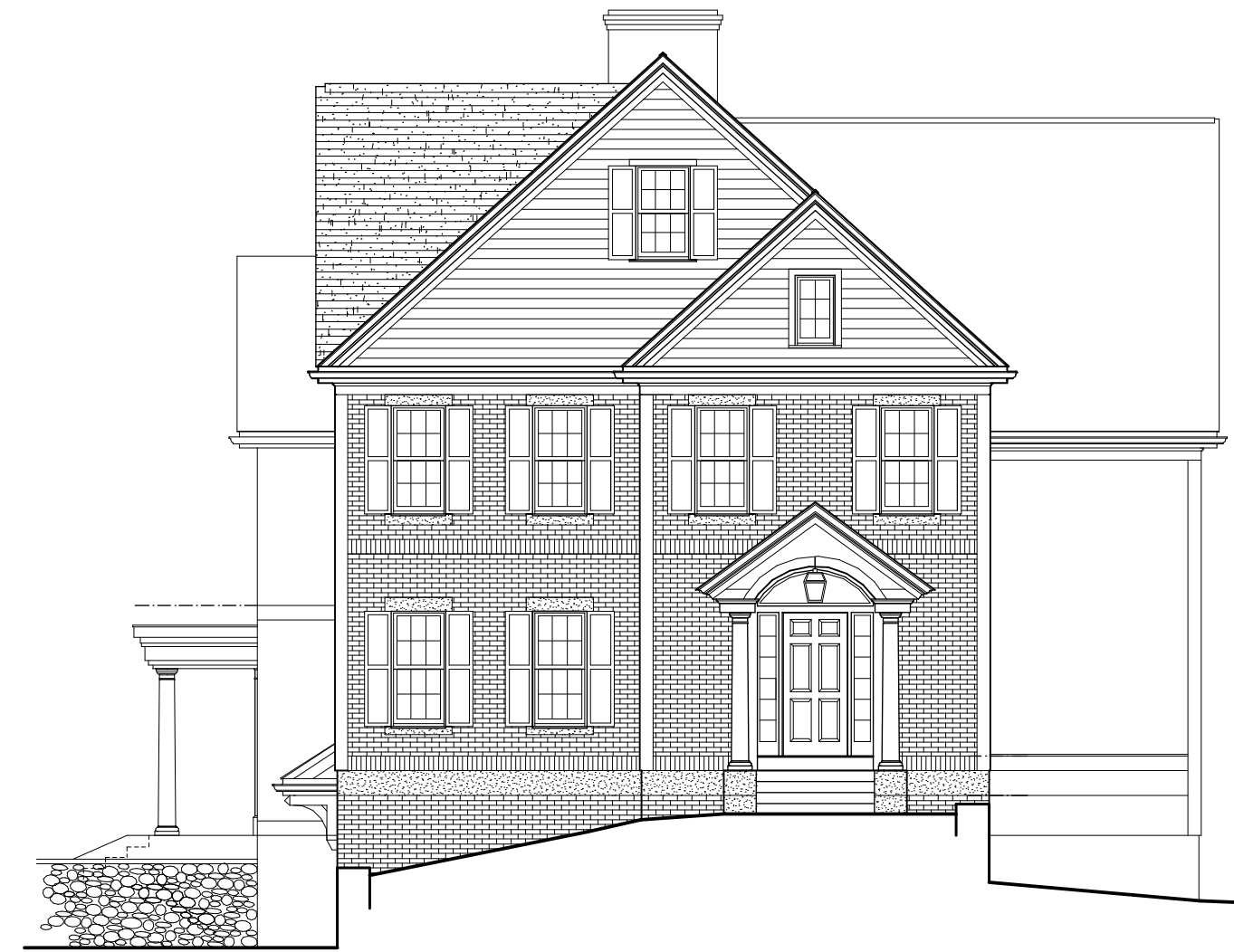
5 UNIT #3 EAST ELEVATION SCALE: 1/8" = 1'-0"