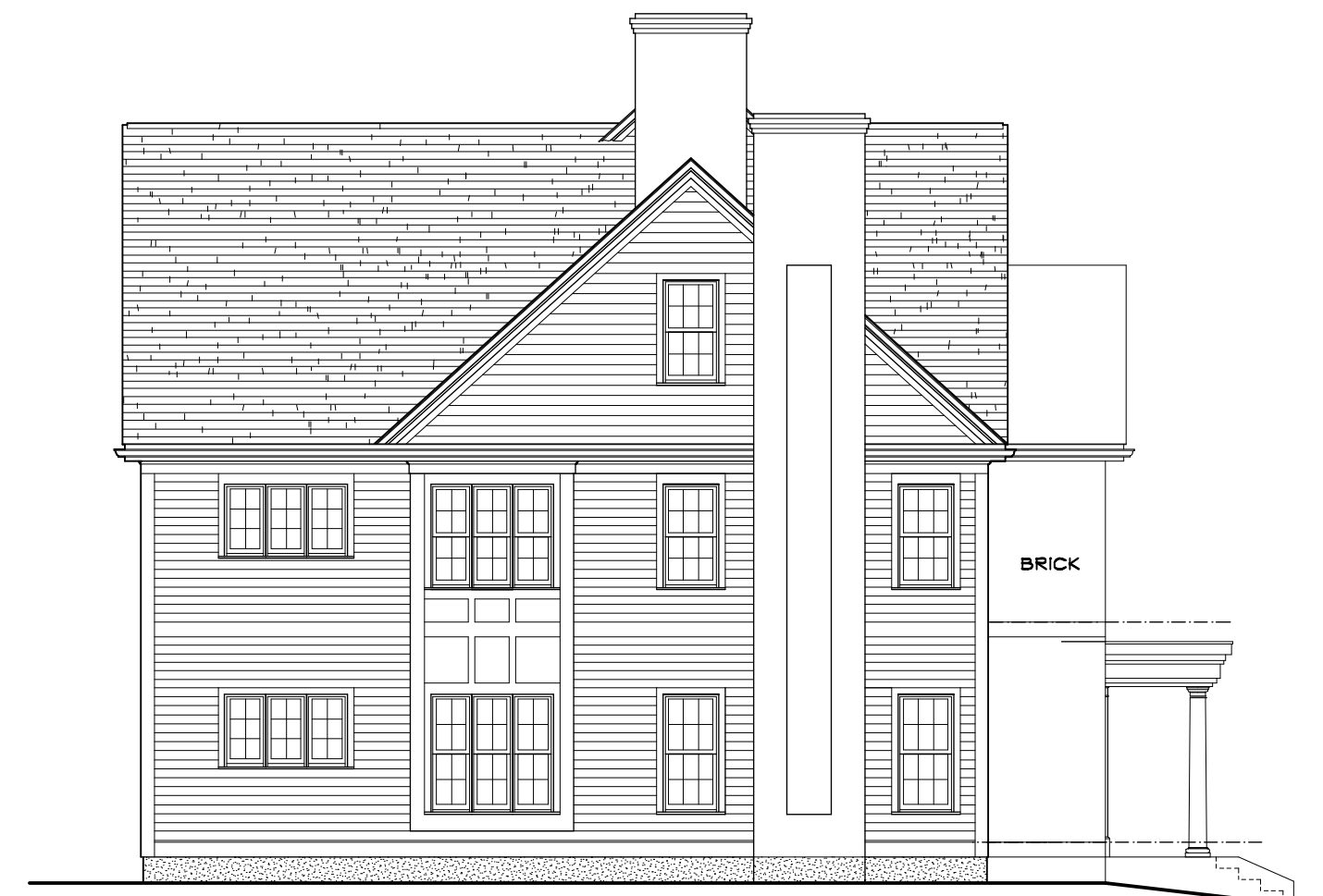
7 UNIT #4 WEST ELEVATION SCALE: 1/8" = 1'-0"