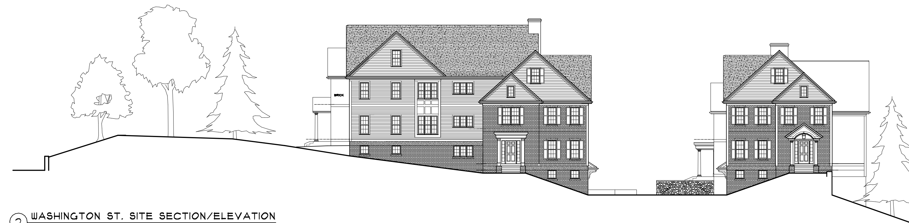
② WASHINGTON ST. SITE SECTION/ELEVATION SCALE: 1/4" = 1'-0"